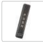
Wireless Push Switch