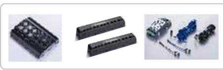
6 Key Remote Switch Motion Sensors X 2 nos Photo Safety Sensors