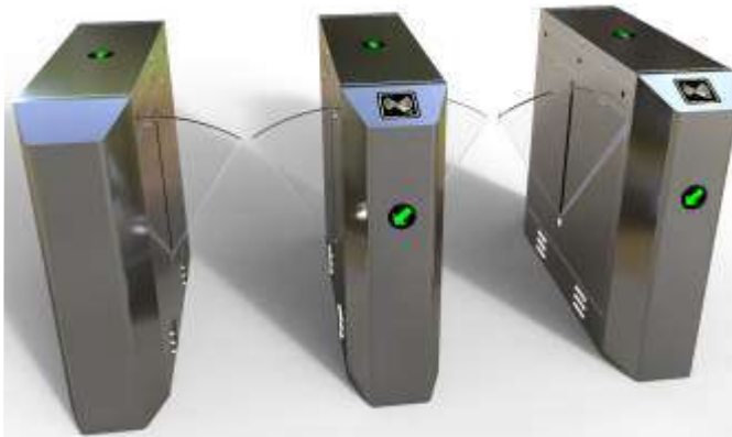
SP FLP Single