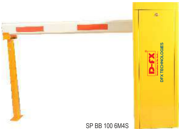
SP BB 100 6M4S

For Residential & Commercial purpose SP BB 100 (6 Meter 4 Sec)