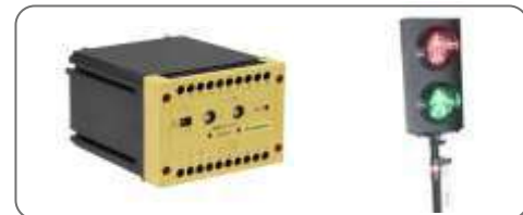
Loop Detector ( Double)