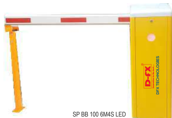
SP BB 100 6M4S LED