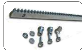
MS Gear Rack (1 Meter) with Bolts