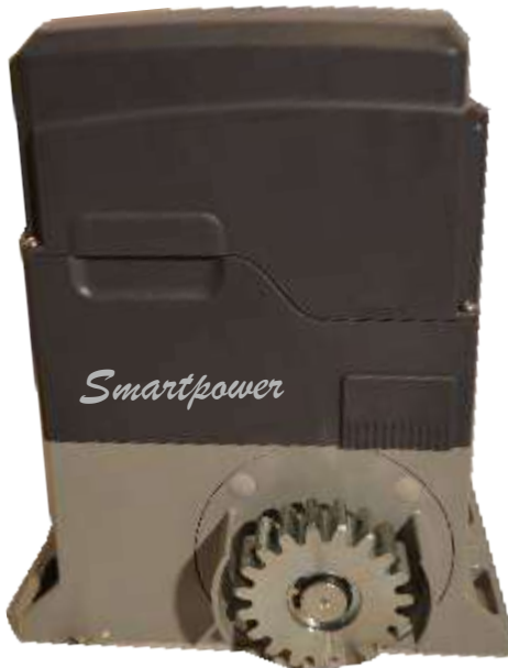
SP SLG 2500B ML

For Residential, Commercial & Industrial Gates SP SLG series (300 ~ 4000 Kg Gates)